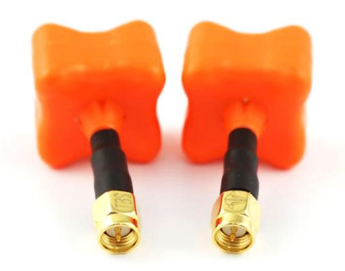
RP-SMA - center-pin (LHCP antenna)