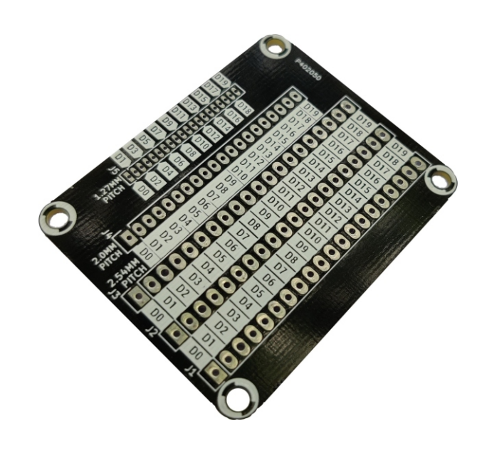
Header Breakout Board